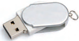
Baby Twister 13151BAB